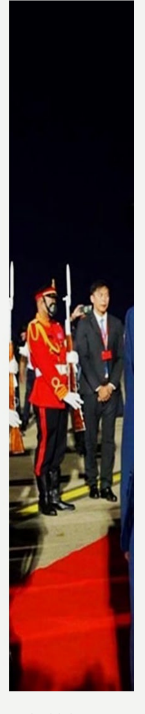
Legislative Updates and Achievements